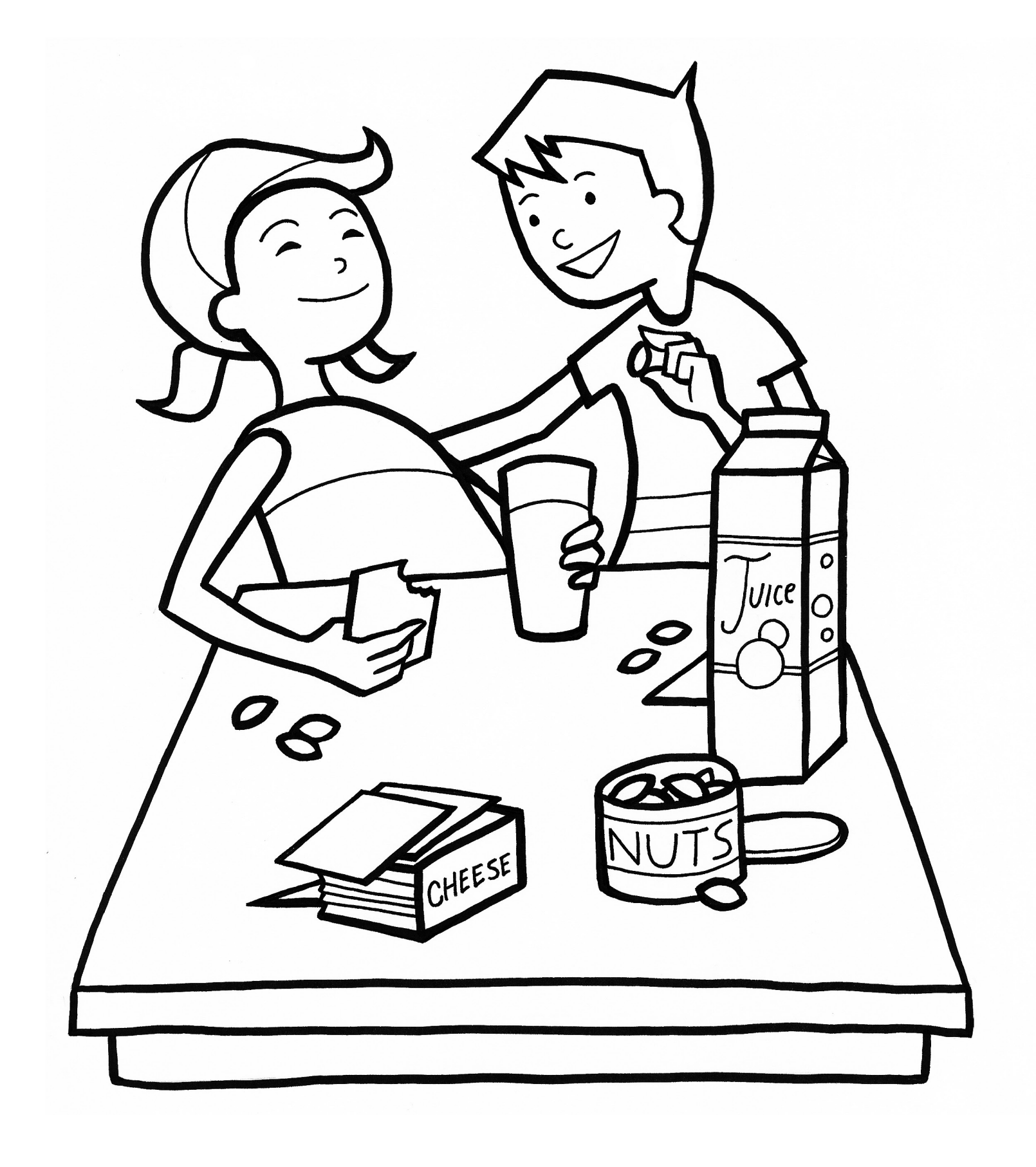
Eat a healthy snack... Farmer Cooperatives