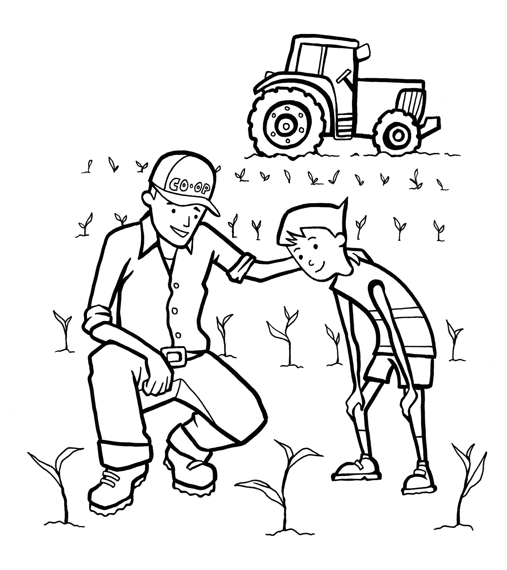
Plant crops.. Farm Supply Cooperatives