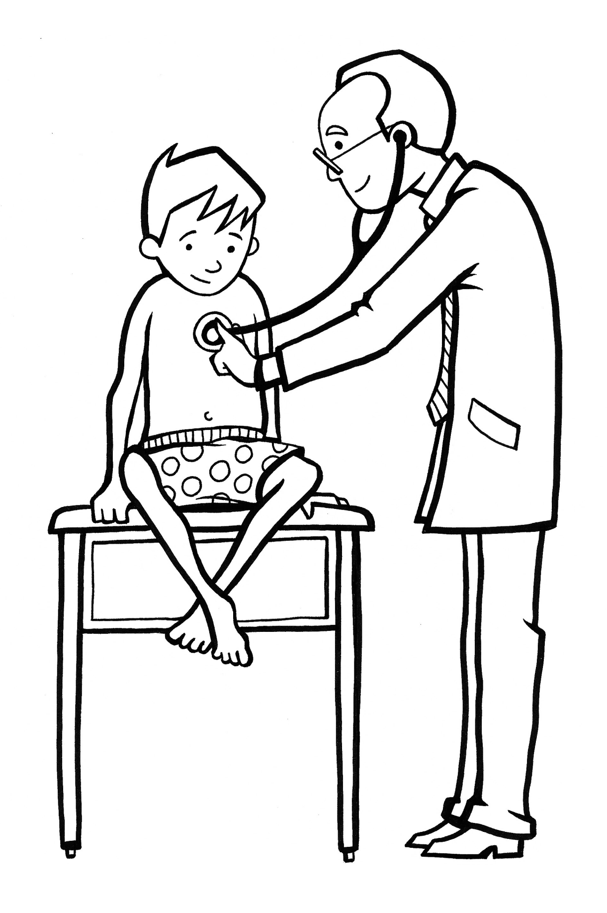
Go to the doctor... Health Care Cooperatives