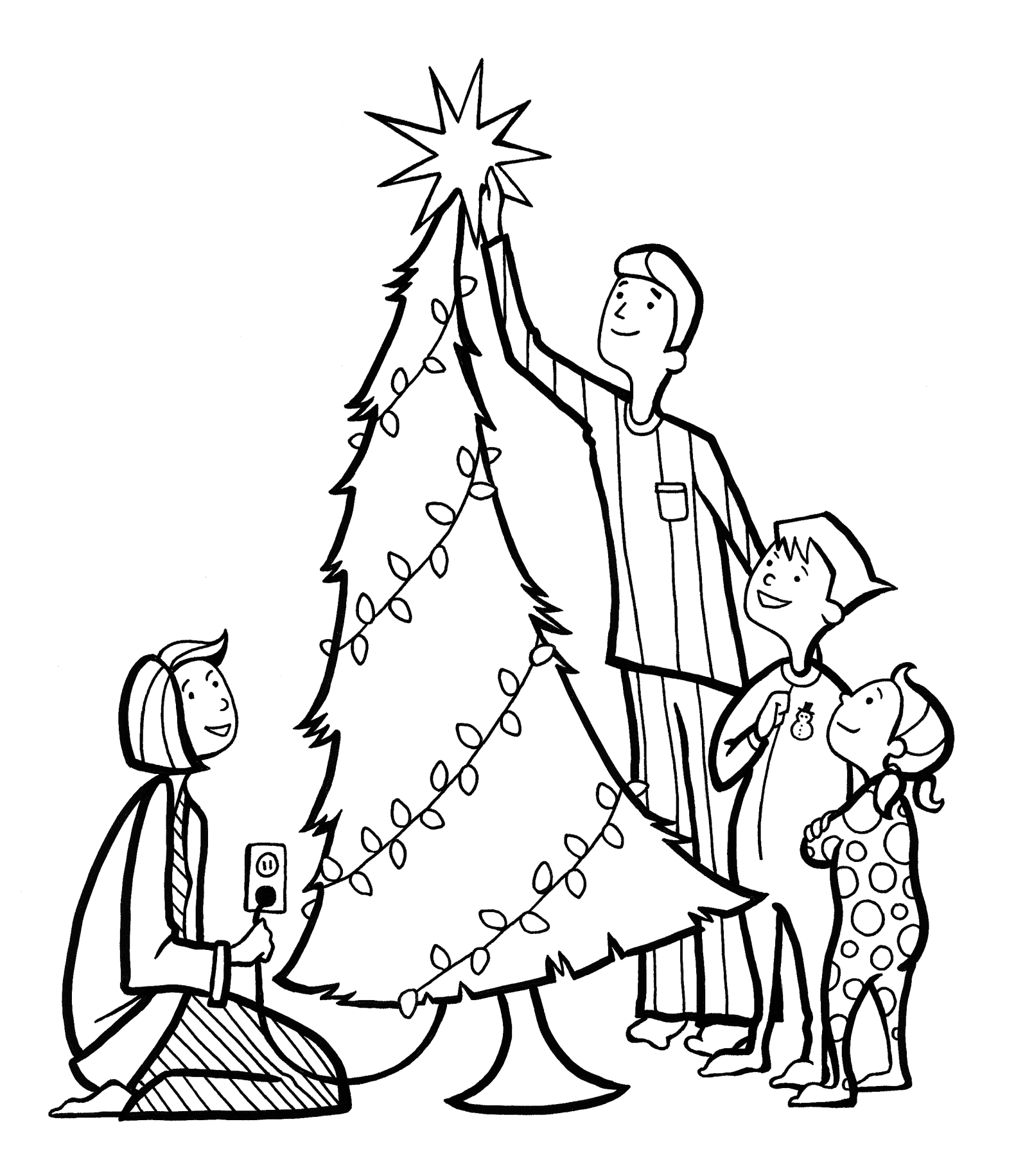
Light the tree... Electric Cooperatives